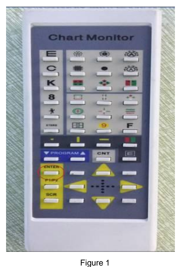
Step 2: Press the "Enter" key for two times to choose the "Mirror" menu.

Step 1: Please hold the "Enter" button as Figure1 for three seconds, you will enter into the setting interface.